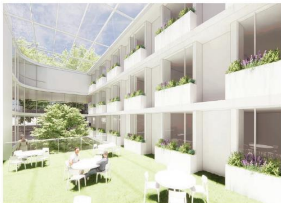
VIEW FROM INSIDE THE COURTYARD