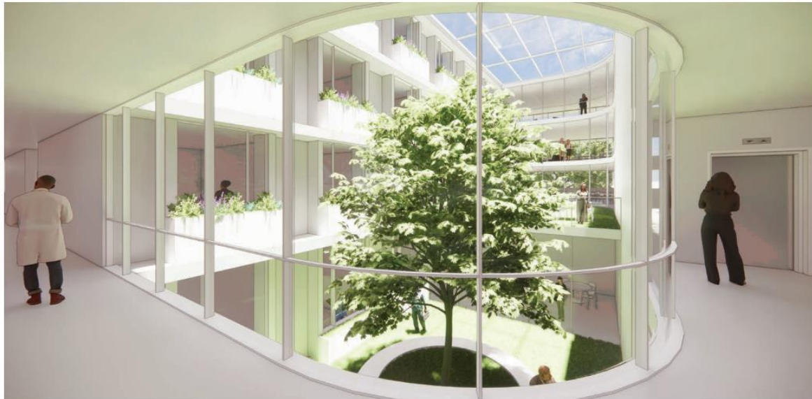
VIEW FROM HOUSEHOLD CORRIDOR TOWARD COURTYARD

Following is some artistic images of this space: