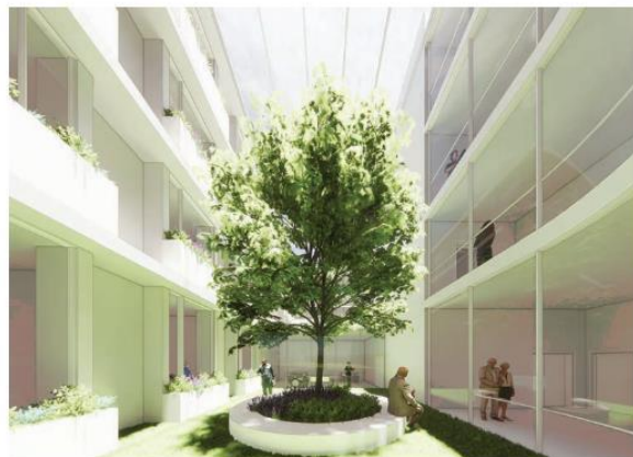
VIEW FROM INSIDE THE COURTYARD